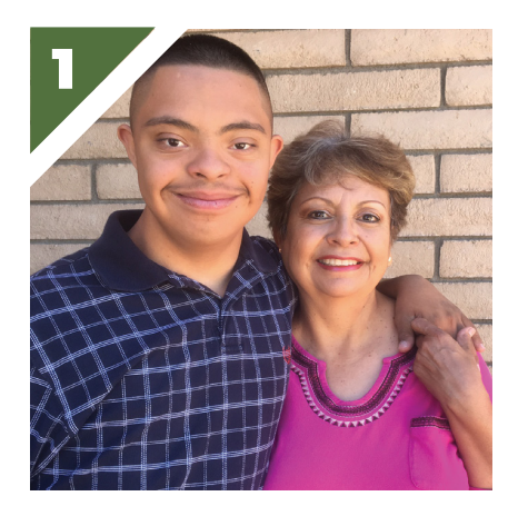
CREATE AN ACCOUNT Visit www.vermontable.com