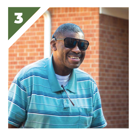
SAVE. INVEST. SPEND. Balances and distributions do not affect benefits like Medicaid and SSI (Subject to some limitations)

Open a STABLE account at VERMONTABLE.COM